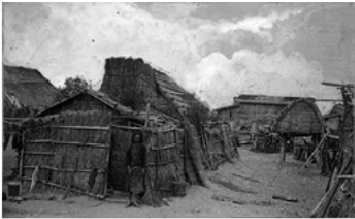
16 746, 28833, USNM047491.00, pl. 25, XCVIII