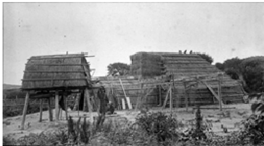
14 744, 28830, USNM047495.00, pl. 29, CII