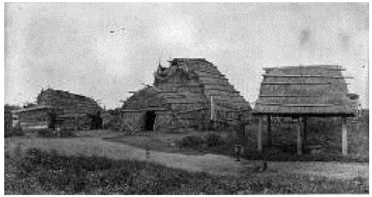
10 741, 28834, USNM047494.00, pl. 28, CI