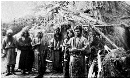
12 742*, 28838, USNM047537.00, -, -