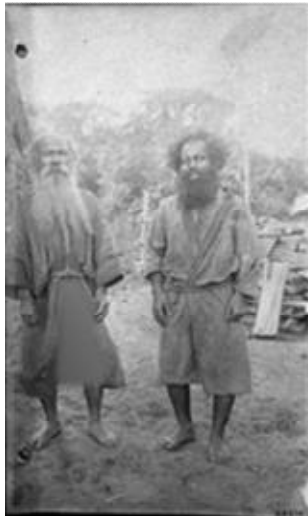
20 759*, 28377, USNM 047531.00, -, -