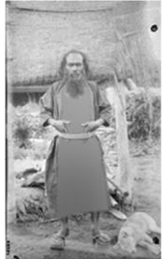
22 761*, 28384, none, -, -