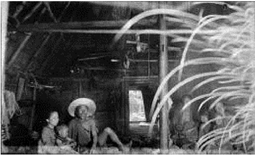
11 220*, 28767, NAA INV 05282800 -, -