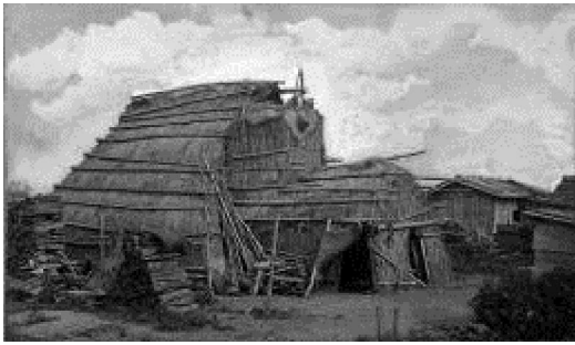
9 740, 28768, USNM047493.00, pl. 27, C