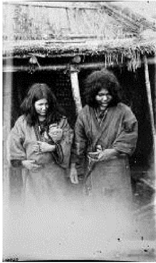
18 757*, 28825, USNM047536.00, -, -