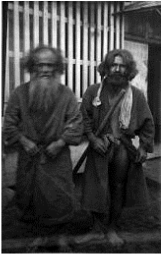
17 749, 28379, USNM047481.00 & 047482.00 pl. 16, LXXXVII