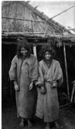
21 760, 28383, USNM047485.00 & 047486.00, pl. 18, XCI