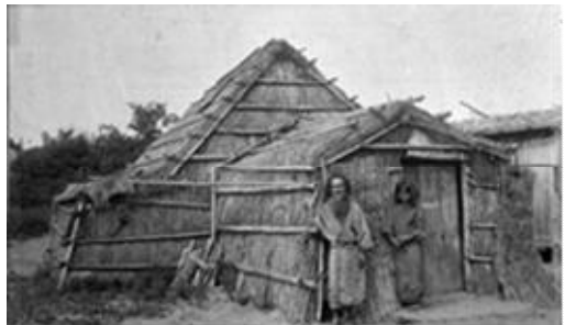
15 745, 28831, USNM047492.00, pl. 26 XCIX